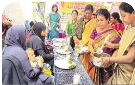
శాస్త్రకాహారం అందజేస్తున్న అధికారులు, ప్రజాప్రతినిధులు