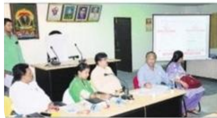
సమావేశంలో మేయర్, కమిషనర్, వైద్యులు